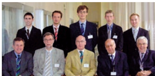
Winners of SPC 07 with the Jury members

Enschede; and a joint award to Bogazici University, Istanbul, and Middle East Technical University, Ankara, Turkey, for organizing the 3rd Science Parks Summit, 3-4 November 2006, Istanbul, Turkey. The purpose of this new recognition system serves to change the mind