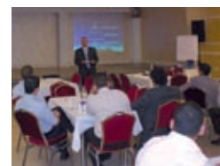
IEEE Jordan GOLD AG holds a Market Entry Workshop for new engineers

The audience learned about entering the job market and how to deal with daily challenges they might face.