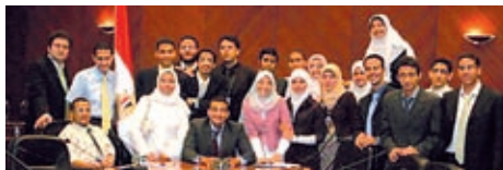
Alexandria Student Branch members