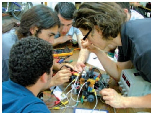
METU RAS SB Chapter members working on the robot