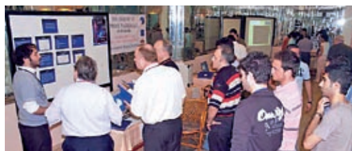
One of the finalists explaining his project to the audience