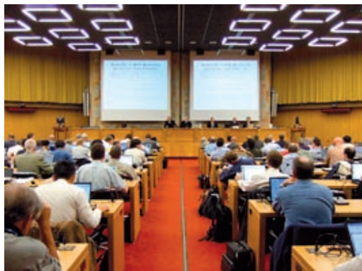
Joint ITU-T/IEEE Workshop participants

The Joint Workshop was a great success with the original estimate of 120 attendees was well exceeded