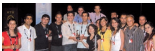
Winners of Darrel Chong Award: IEEE Bogazici University and METU SB