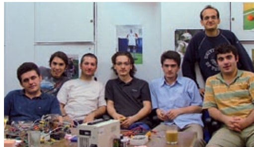
METU RAS SB Chapter RoboTurk project team members

'DESCRIBE YOUR School' is a web site contest organised by IEEE METU Student Branch, supported by IEEE Foundation, for pre-college students to which all students throughout the Turkey will be able to join.