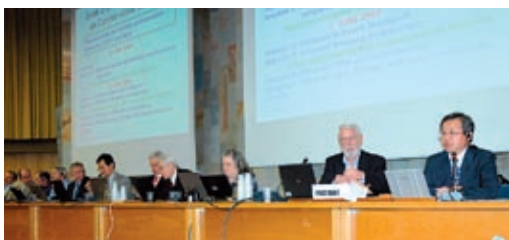
Joint ITU-T/IEEE Workshop speakers