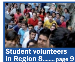
Student volunteers in Region 8..... page 9