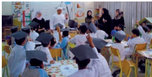
IEEE AUST WIE members visited Al-Qasimiah School

IEEE AUST SB Secretary nakalaji@hotmail.com