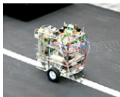
The winning robot