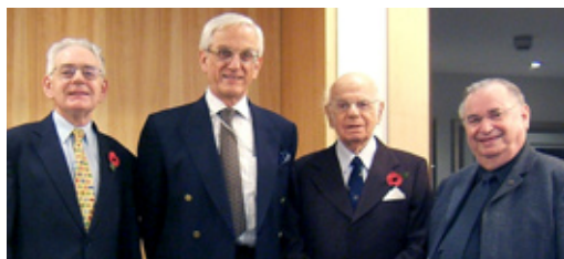
History Activities council meeting in London