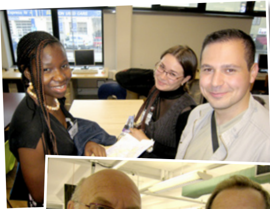
Photo call from Region 8 Student Branch and GOLD Congress 2008