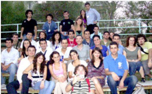
Cukurova Student Branch, Turkey: