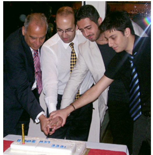
Cutting the cake (left to right): BAU author, chairman, BAU volunteer, ESIB volunteer