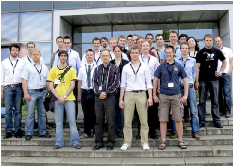
Obafemi Awolowo University, Nigeria: