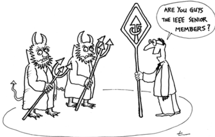
cartoon © Tolyan Aygül