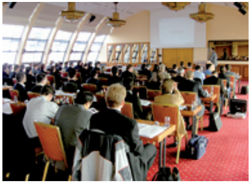
All hands on deck: the main conference room.

Sponsored by the German Research Association (DFG), Smart Microwave Sensors (SMS) and the IEEE Communications Society Germany Chapter, the workshop attracted more than 90 guests and speakers on an international level with contributions from Poland, South Korea, Italy, the United Kingdom, France, Sweden, Turkey, the