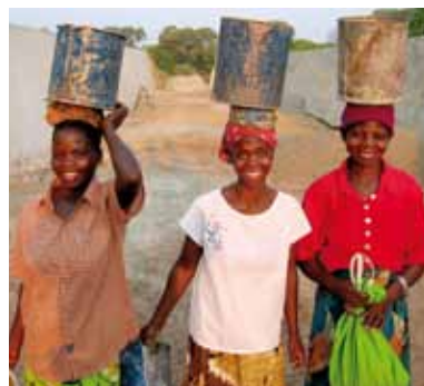
Below: Construction workers arriving on site.