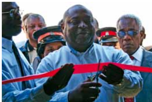
Zambia's Minister of Energy, Mr K Konga, cuts the ribbon in July 2007 before switching on the turbine (right).