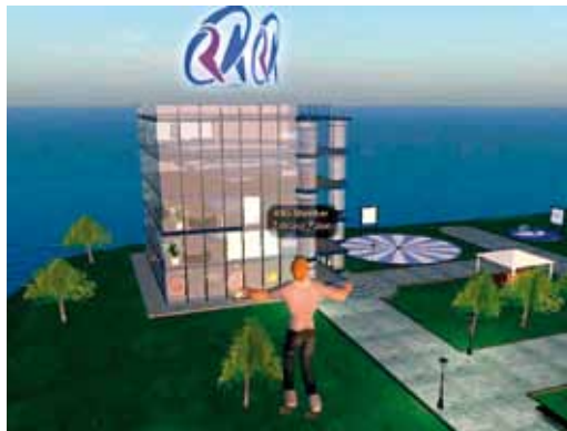
IEEE-RAS activities are hosted in this five-storey building.

In the first demo, three robots are controlled in a leader-followers formation, led by any avatar entering the area. In the second demo, there is an anthropomorphic robot simulating a bartender serving beverages to avatars in the bar area. Two other demos have been designed