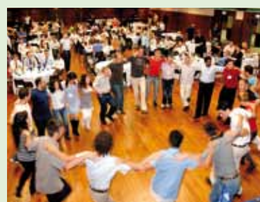
Dancing during the Gala Dinner in the historical Boxing Hall of East London.