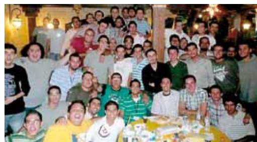
University of Jordan:

Afterwards, the presenters entered into discussion with the students, who were quick to express their great interest in joining IEEE.