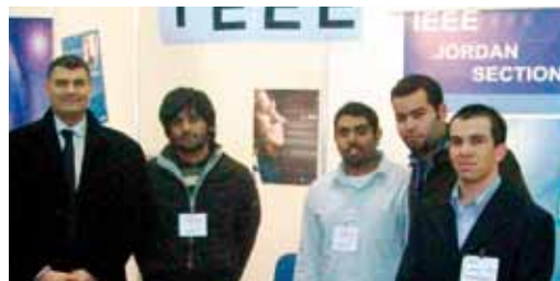
Students helped to staff the IEEE Jordan Section booth