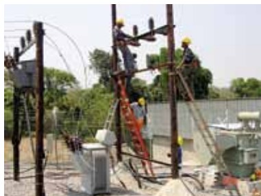
Above: Installation of the conductors for the main transformer in the main substation.