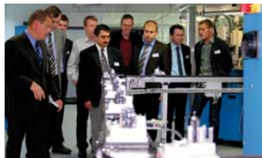
Chapter members visit the Dr Fritz Faulhaber company site.