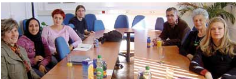
Attendees at the WIE event, hosted by the Bosnia and Herzegovina WIE Affinity Group.