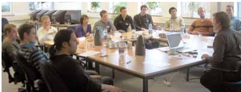
Attendees participate in joint blackout scenario training.

Otto-von-Guericke-University Magdeburg, VDE Hochschulgruppe Bochum, FH Bielefeld: