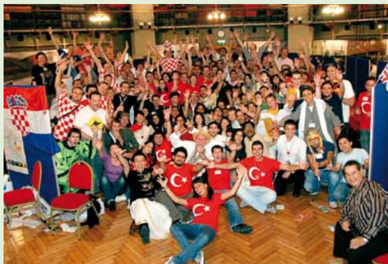
SBC participants enjoy the Multicultural Night.