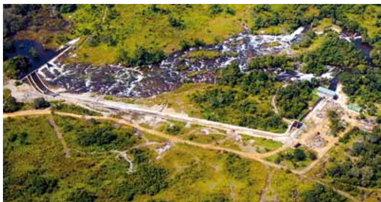
Above: The full extent of the Zambezi Rapids hydro-electric scheme as seen from the air. Right: An implementation team installs a distribution transformer that will power up a mobile phone tower.