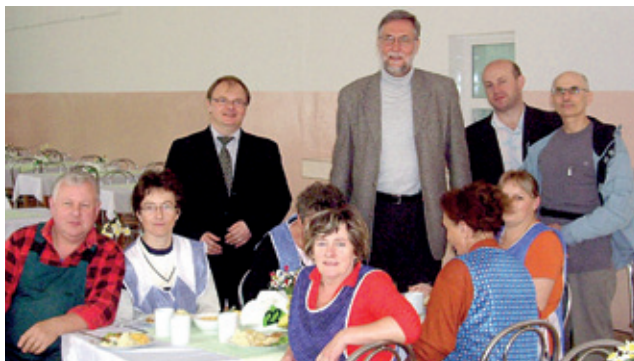
WILGA Symposium organizers express their appreciation to the hard-working WILGA Village WUT Resort staff – taking a brief rest!