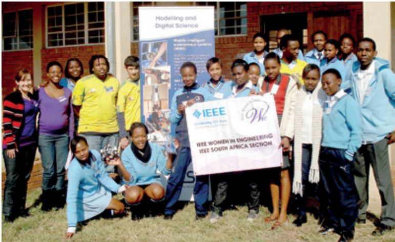
IEEE members, MIAS researchers and STAR learners.