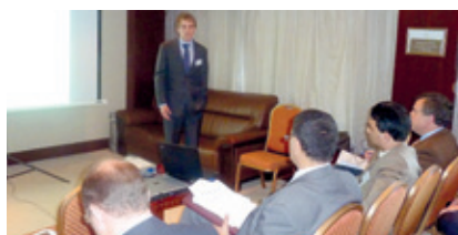
Delivering the presentations...