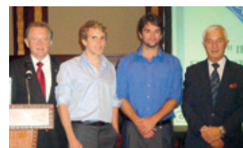
... and receiving the awards.