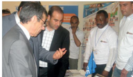
The Secretary of State visits the Student Branch stand.

http://ewh.ieee.org/r8/tunisia/ras/robocomp