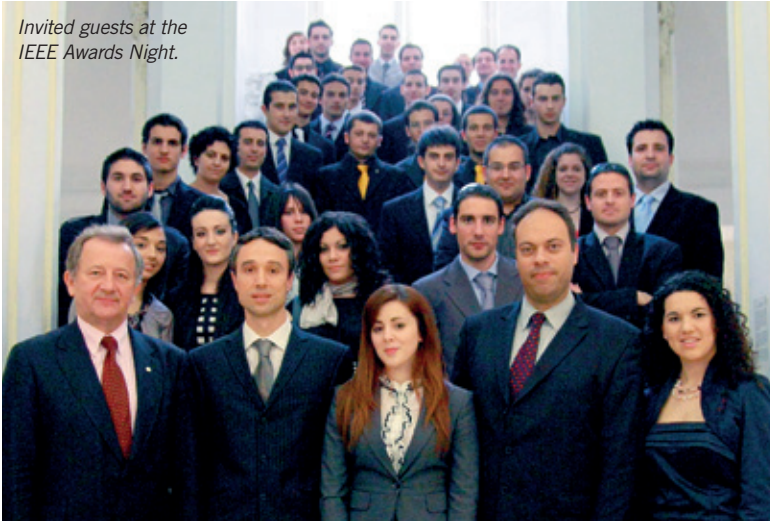
Invited guests at the IEEE Awards Night.