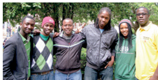
The UCT Student Branch project committee.

Engineering Projects in Community Service (EPICS)-High is a pre-university initiative of the IEEE Educational Activities Board, enabling vertical integration between high/secondary school learners and university students. This year's initiative at UCT is led by postgraduate students who are part of the Student Branch project committee. Two high-schools in the Western Cape – Oaklands and Oude Molen Technical – have been engaged.